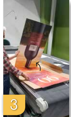
Unfold signage tube.