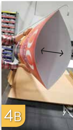
Carefully pop-open signage tube.