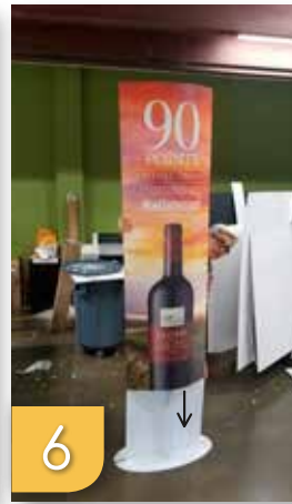
Slide over base. Be mindful of corners.